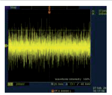
Measurement of PE ground noise in a machine with VFDs on